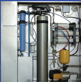
HOMESAFE™ WHOLE HOUSE WATER TREATMENT SYSTEM

The HOMESAFE™ water system can effectively remove or reduce contaminants in the water supply such as suspended solids and dissolved minerals. Chlorine, Nitrates, Arsenic, Radon, Selenium and other substances can be removed to comply with clean water standards.